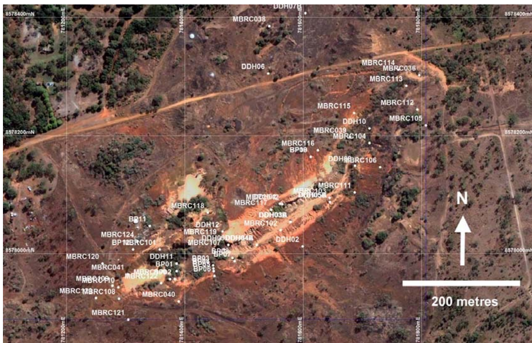
Figure 1 – Drilling at Mount Bundy historical pit.

As a result, ongoing tenure granted under the Authorisation (AN25438) in this area is currently under review.