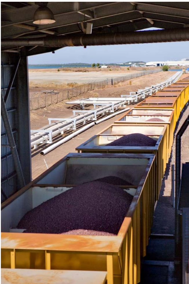
Territory's first iron ore train.